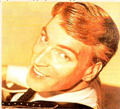
Singer Frank Ifield, a popular performer on TV pop shows such as 'Bandstand'

The first major station in the Snowy Mountains Scheme begins production of electricity.