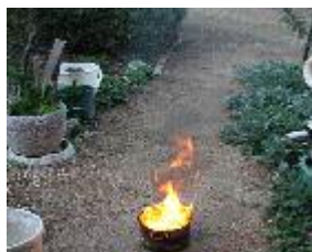
The above photo shows the pan on fire outside our home