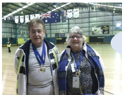
Young At Heart Games